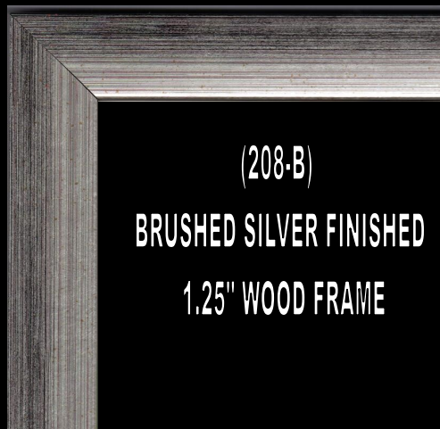
(208-B) BRUSHED SILVER FINISHED 1.25" WOOD FRAME

(3) Double Matted Giclee' Prints on 61# Acid Free Paper with Certificate of Authenticity.