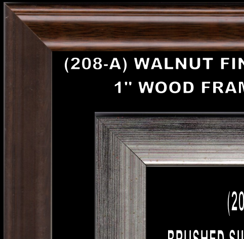
(208-A) WALNUT FINISHED 1" WOOD FRAME